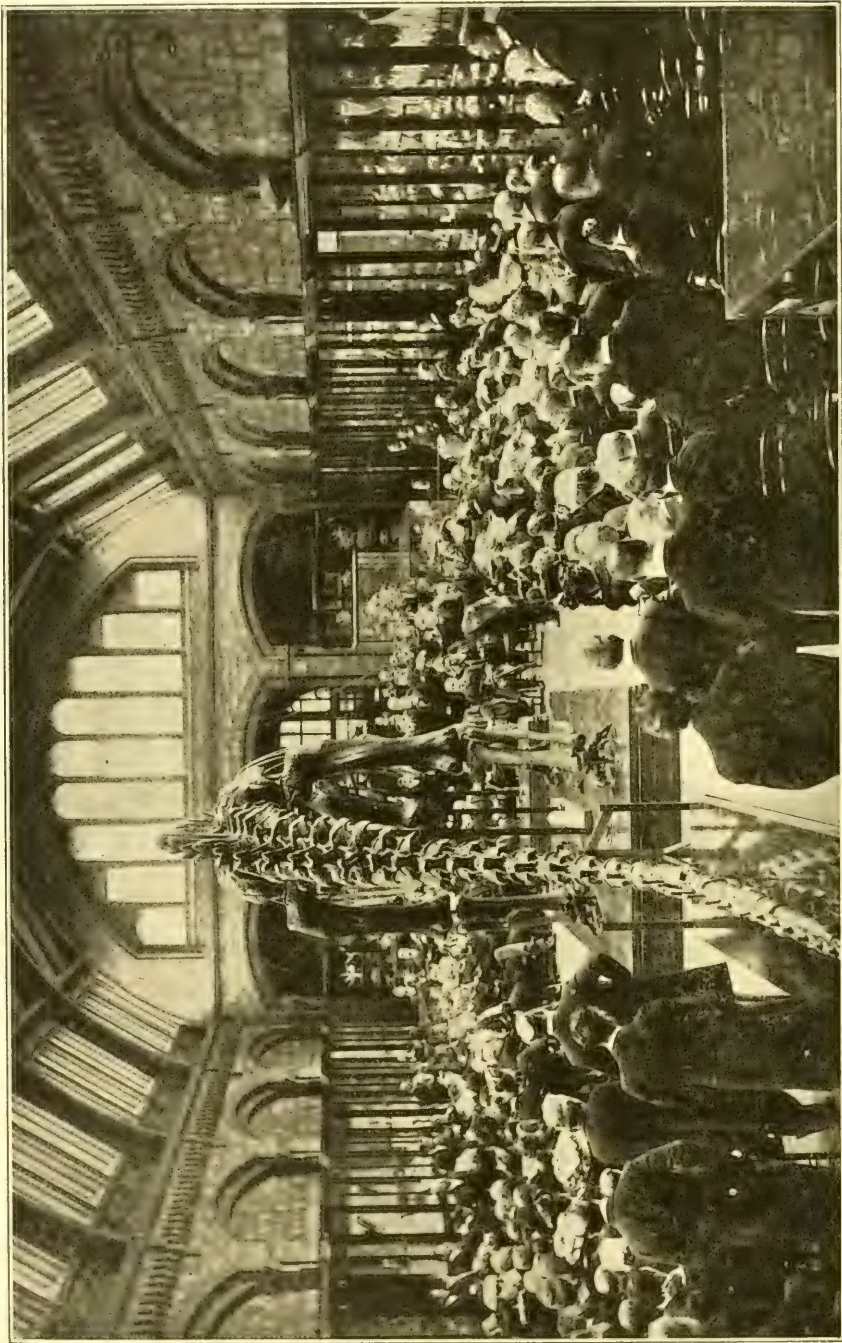
Presentation of the Reproduction of the Skeleton of Diplodocus Carnegiei in the Gallery of Reptiles at the British Museum (Natural History), May 12, 1905. Lord Avebury addressing the audience.